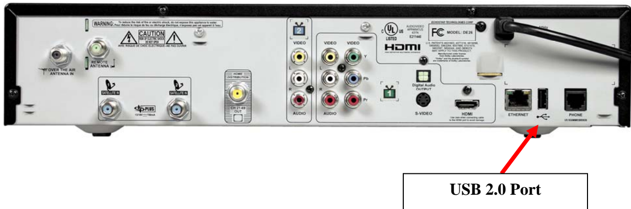
Photo Showing USB 2.0 Port on the Rear View of a ViP® 722 HD DVR receiver