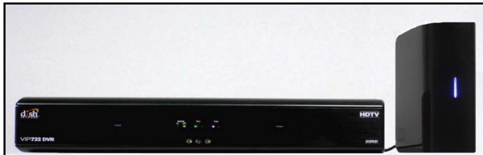
Photo of a ViP® 722 HD DVR receiver with a 500 GB Western Digital My DVRExpander™ External Hard Drive Connected

You can expand the recording storage capacity of your DuoDVR™ ViP® 722 or 622 or the Solo DVR ViP® 612 HD satellite receiver by connecting a DISH compatible USB 2.0 external hard drive. Programs can be transferred from the DVR of the receiver to an external hard drive for storage or playback. If desired, the program can be transferred from the external hard drive back to the DVR of the receiver. A one-time activation fee applies.