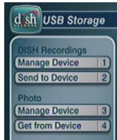
USB Storage Menu